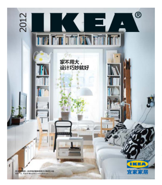
IKEA's Chinese Catalog

International Marketing. Marketing to several different cultures, in several different languages, is