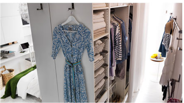
IKEA's Modular designs make tight spaces efficient

Because China and most of Asia are very populated, there is typically very little available space for family homes. So homes are small and very compact. Because of this, IKEA's products are ideal to fit due to their sleek design and modular functionality. In a market hungering for Western