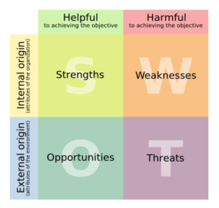
SWOT Box Diagram