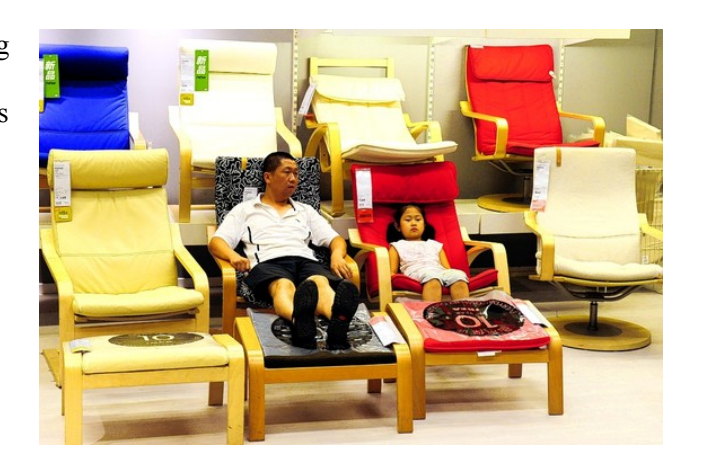
Consumers enjoying IKEA's Beijing Store.

China/Asia. No nation's economy is growing faster than China. With the trend for Asian nations to westernize their pop culture, China provides a gold rush opportunity for corporations wishing to expand their business. For IKEA, much of China is financially challenged, and can use the